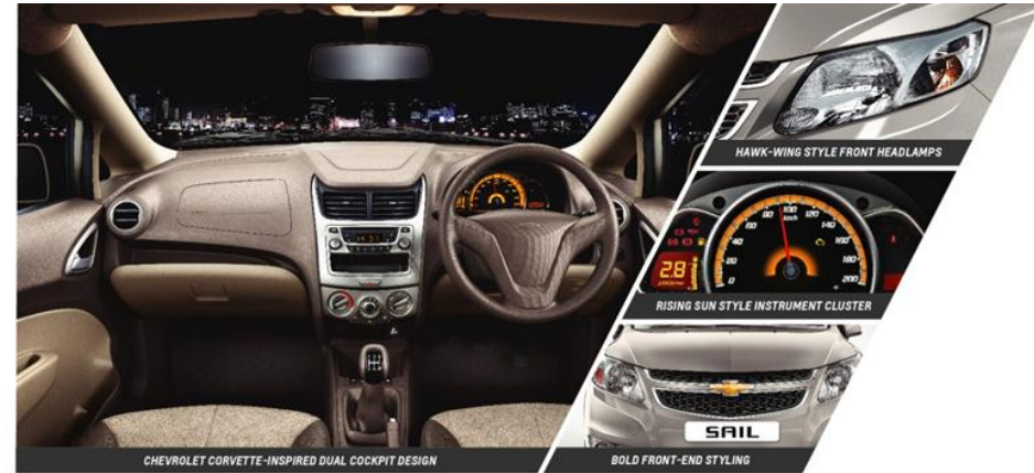
CHEVROLET CORVETTE-INSPIRED DUAL COCKPIT DESIGN

The Chevrolet SAIL embodies the bold pioneering spirit and ingenuity which has become the hallmark of Chevrolet. A stylish and muscular yet classy sedan, this car is artistically sculptured to the tee, while its muscular contours give it a classy three-dimensional trend-setting form. Loaded with only the most-advanced safety features, superior boot space, luxuriously spacious interiors and powertrain options; the Chevrolet SAIL is for the urban heroes looking to conquer life.