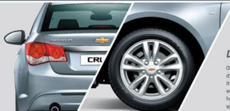
SPLIT DESIGN TAIL LAMPS