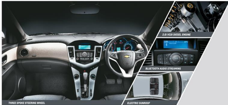
THREE SPOKE STEERING WHEEL