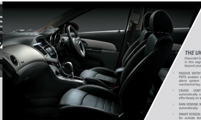
CHEVROLET DUAL COCKPIT WITH JET BLACK LEATHER INTERIORS