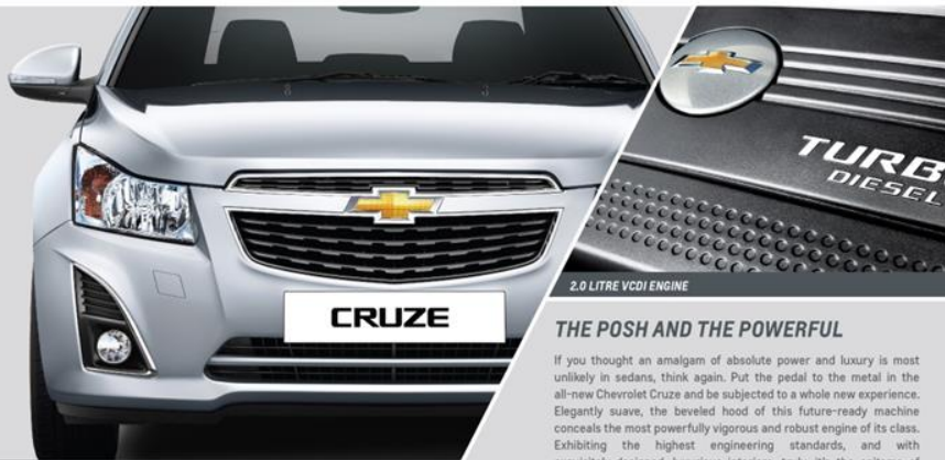
2.0 LITRE VCDI ENGINE