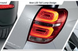
New LED Tail Lamp Design