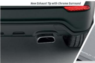
New Exhaust Tip with Chrome Surround