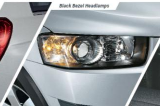
Black Bezel Headlamps